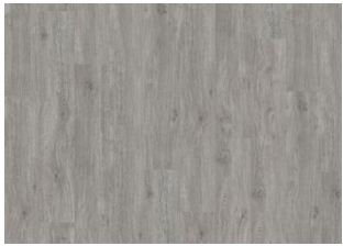
XPRESSION WARM GREY