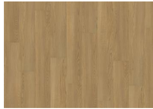
XPRESSION GOLDEN OAK