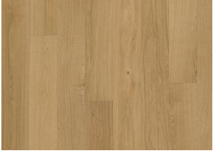
OAK DUBLIN ULTRA MATTE