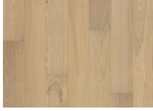
OAK PARIS ULTRA MATTE