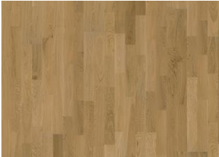
OAK VERONA ULTRA MATT