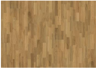
OAK SIENA SATIN