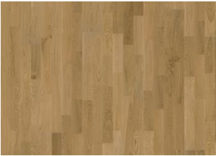
OAK VERONA MATT