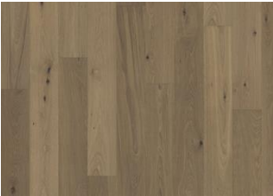
Piazza Smoked Oak CD Grey