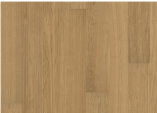
Piazza Oak AB

All samples, images and product description, plus photo and brochure specifications are there for the sole purpose of giving an approximate idea of the items described in them. They shall not form part of the contract or have any contractual force and should be viewed for illustrative purposes only. We cannot guarantee that your computer's display or the quality of the print will accurately reflect the colour of the products. Your product may vary slightly from the images within this literature.