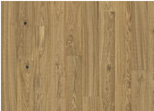
Piazza Oak CD Sawmarks