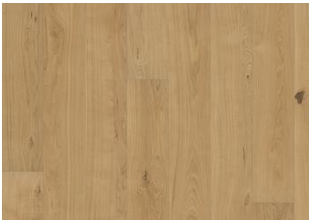
Piazza Oak CD