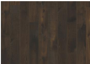
Piazza Smoked Oak CD 11 mm