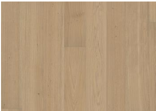
Piazza Oak AB White 11 mm