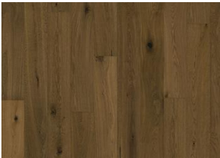
Piazza Smoked Oak CD 11 mm