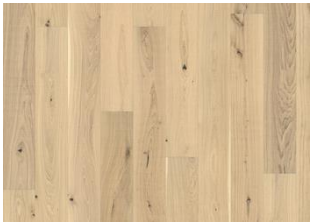
Piazza Oak CD White Sawmarks