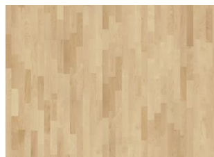
Hard Maple Toronto