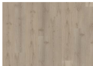
Dovecot - Click 6 mm Impression