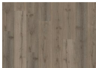
Spreewald - Click 6 mm Impression