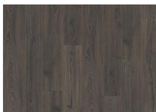
Odenwald - Click 6 mm Impression