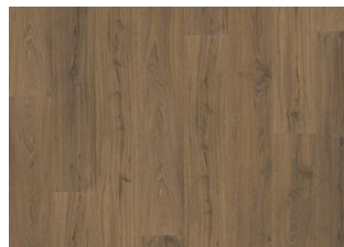
Saham - Click 6 mm Impression