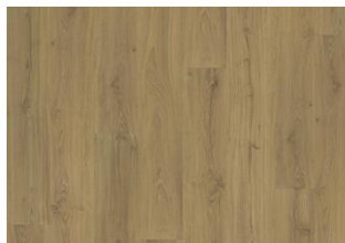
Foxall - Click 6 mm Impression