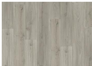
Laponia - Click 6 mm Impression