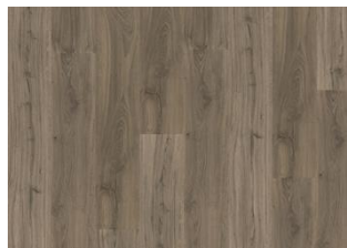
Kelham - Click 6 mm Impression