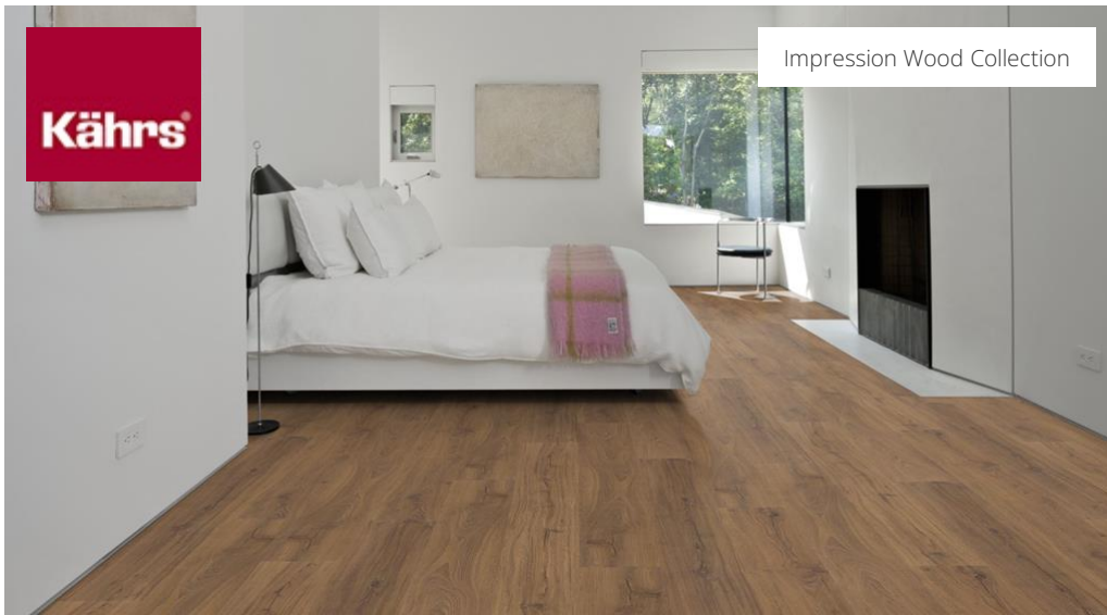
Impression Wood Collection