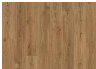
Sumava - Click 6 mm Impression