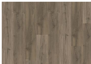
Kelham - Click 6 mm Impression