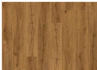
Harz - Click 6 mm Impression