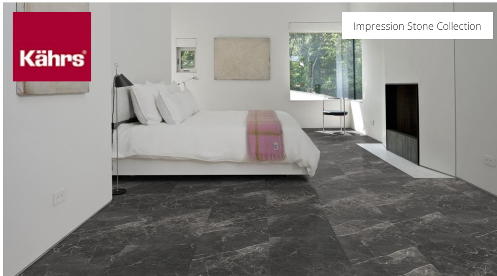
Impression Stone Collection