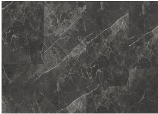
TALUNG - CLICK 6 MM IMPRESSION