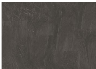
Amaro - Click 6 mm Impression