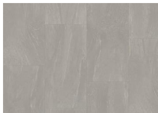
Athos - Click 6 mm Impression