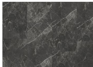
Talung - Click 6 mm Impression