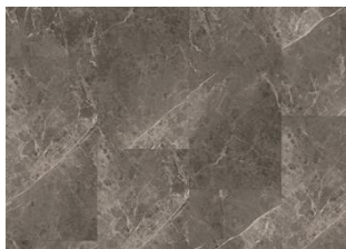
Ultar - Click 6 mm Impression