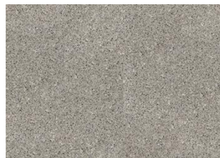
Aneto - Click 6 mm Impression