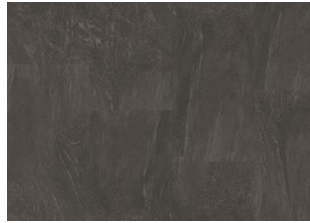
Amaro - Click 6 mm Impression