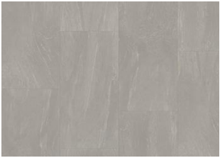
Athos - Click 6 mm Impression