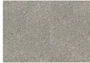
Aneto - Click 6 mm Impression