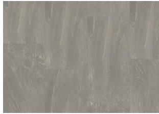
Olympus - Click 6 mm Impression