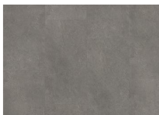
Grossglockner - Click 6 mm Impression