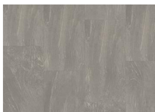
Olympus - Click 6 mm Impression