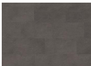
Kilimanjaro - Click 6 mm Impression