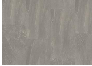
Olympus - Click 6 mm Impression