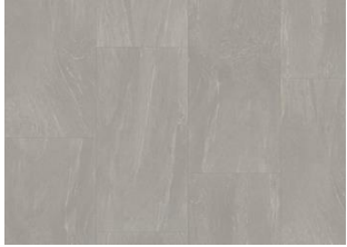
Athos - Click 6 mm Impression