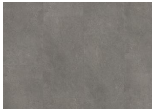
Grossglockner - Click 6 mm Impression