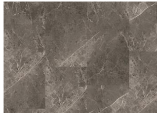
Ultar - Click 6 mm Impression