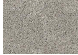
Aneto - Click 6 mm Impression