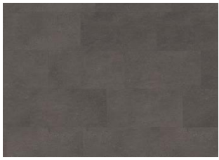
Kilimanjaro - Click 6 mm Impression