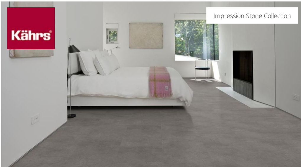
Impression Stone Collection