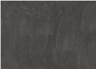
AMARO - CLICK 6 MM IMPRESSION