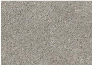
ANETO - CLICK 6 MM IMPRESSION