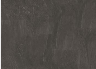
AMARO CLICK XXL