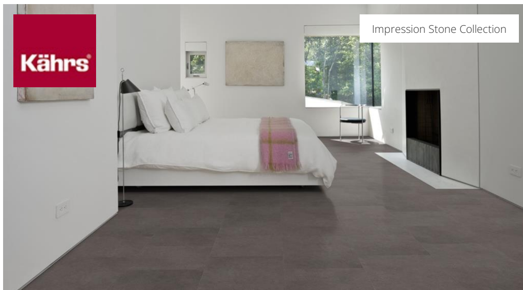
Impression Stone Collection