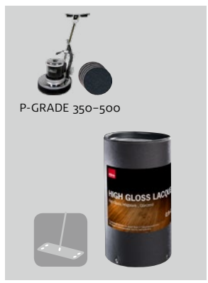
For high gloss floors.