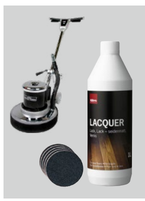
For satin lacquered floors

There are three methods for: floors with satin lacquer, matt lacquer and high gloss lacquer. Chose the method that matches the floor surface treatment of your floor.