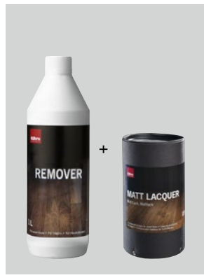
For matt lacquered floors

Allow at least 3 weeks before using strong alkaline cleaning products.