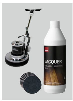
For satin lacquered floors

There are three methods for: floors with satin lacquer, matt lacquer and for high gloss lacquer. Chose the method that matches the floor surface treatment of your floor.