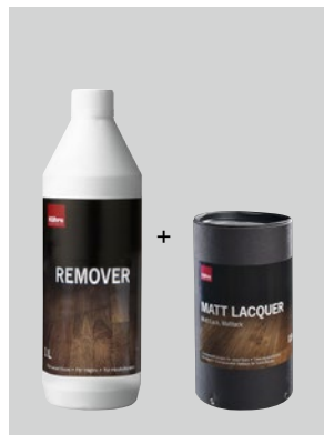
For matt lacquered floors

Allow at least 3 weeks before using strong alkaline cleaning products.