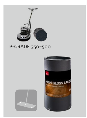
For high gloss floors.